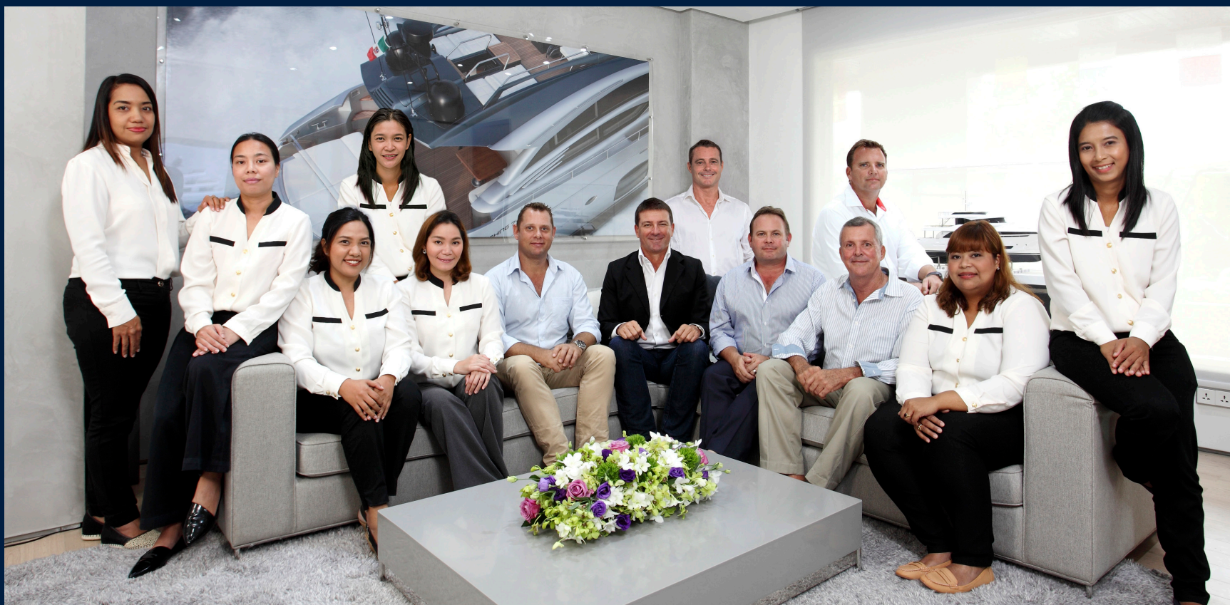
LEE MARINE TEAM