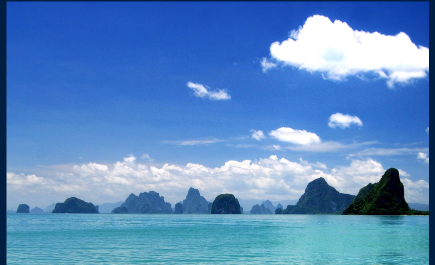
HONG ISLAND KRABI AND PHANG NGA BAY

Thailand is a boating paradise with the Andaman Sea to the west and the Gulf of Thailand to the east. Sublime weather, countless islands, marine national parks and access to the whole of South East Asia makes Thailand a perfect choice. Whether cruising, sailing or diving, with some of the world's best cruising grounds and easy access to world-class marinas, there truly is no better place to buy and own a boat.