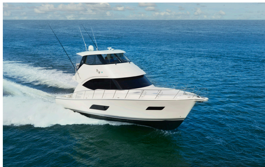
RIVIERA 52 Enclosed Flybridge