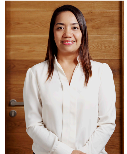
BROKERAGE OFFICE, MS OR AND MS ELLE

The Lee Marine pre-owned yacht brokerage is the most active in South East Asia with the highest volume sales in the region. The Team has solid experience in power and sail, and technical and operational workings of a variety of yachts. This knowledge is integral to the company's high standard operations yet alone a very comforting thought when you are purchasing a yacht. The Brokers communicate freely working together to suitably match clients and yachts.