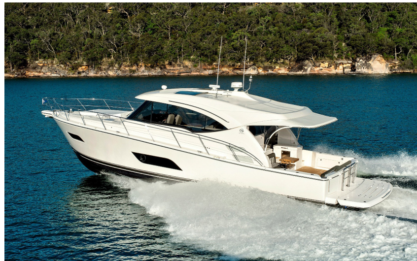
RIVIERA 525 SUV