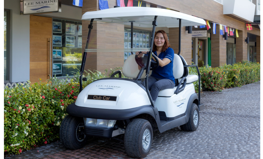
ATARI, LEE MARINE BUGGY

Catch a ride in Lee Marine's golf buggy – whiz off to the Marina docks and step aboard the many yachts listed with Lee Marine International Marine Brokerage.