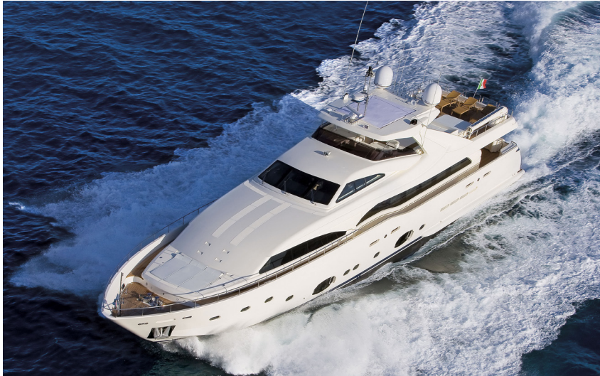
CUSTOM LINE 112