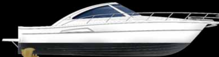
43 Open Offshore Express