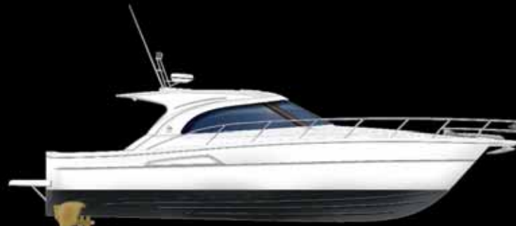
43 Enclosed Offshore Express

Each country and State has different safety equipment standards. It is important that you ensure the requirements in your jurisdiction are met prior to the vessel being used.