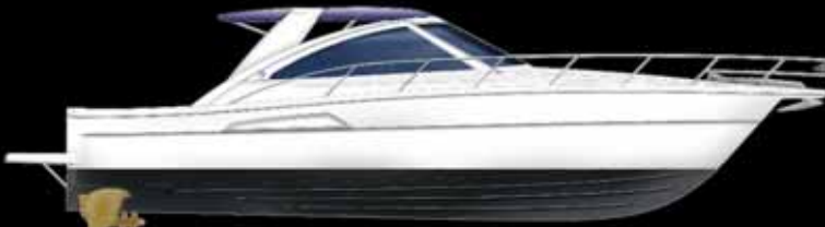
43 Bimini Offshore Express