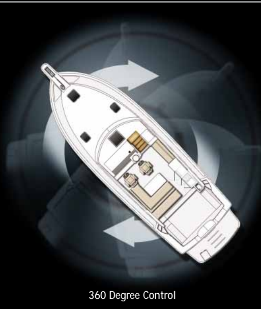
360 Degree Control