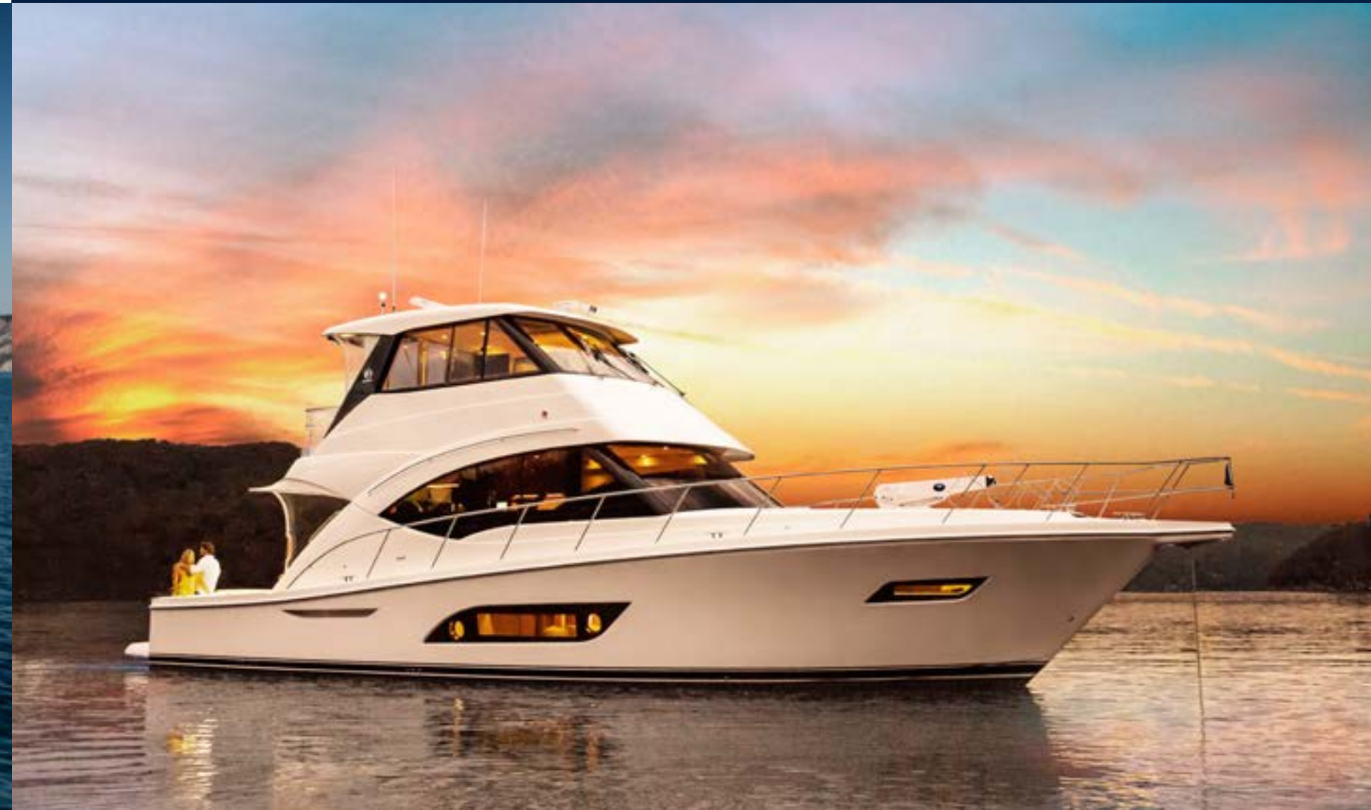
57 ENCLOSED FLYBRIDGE

From a dream that began over three decades ago has emerged Australia's most respected manufacturer of luxury on-water, pleasure craft. With a full range of Sport Yachts and Offshore Flybridge models, the name Riviera is synonymous with quality and practicality. Within Riviera, passion and craftsmanship mesh skilfully with the newest technology producing boats that withstand the test of time, while offering superb sea thoughtfulness and reliability.