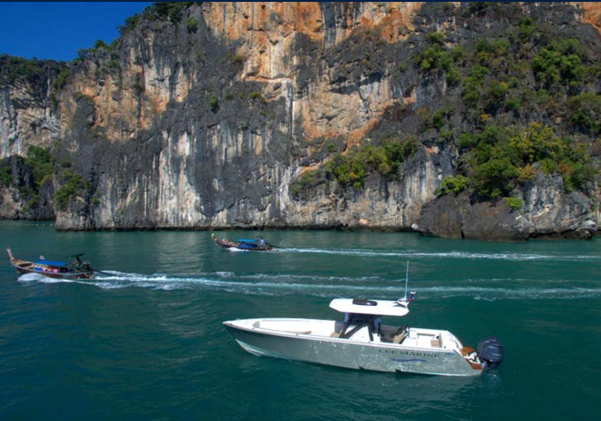
ABOVE: ATARI VI – RIGHT: ATARI, LEE MARINE BUGGY