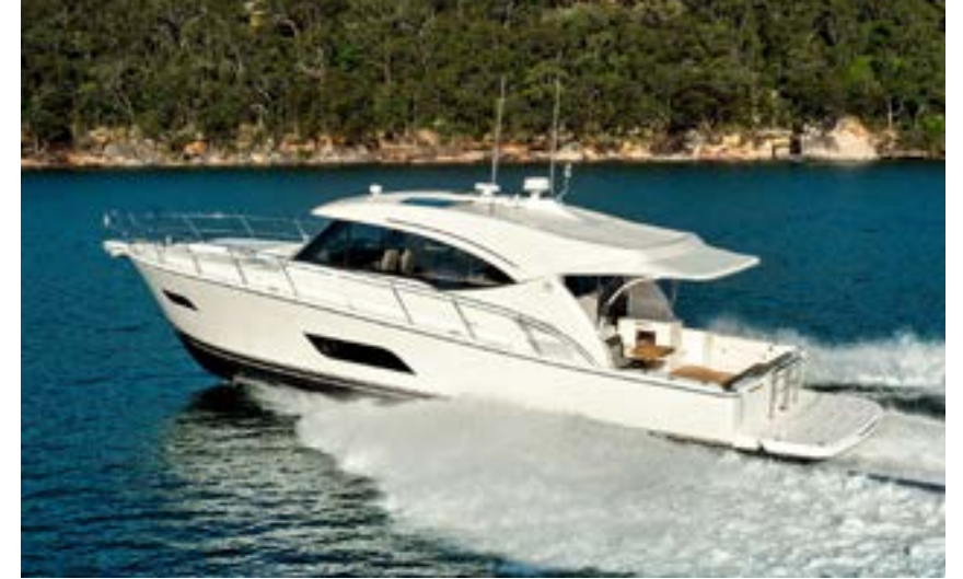
RIVIERA 525 SUV