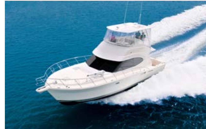
RIVIERA 45 Open Flybridge