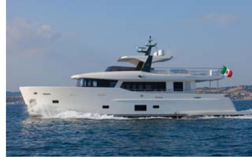
CdM NAUTA AIR 86