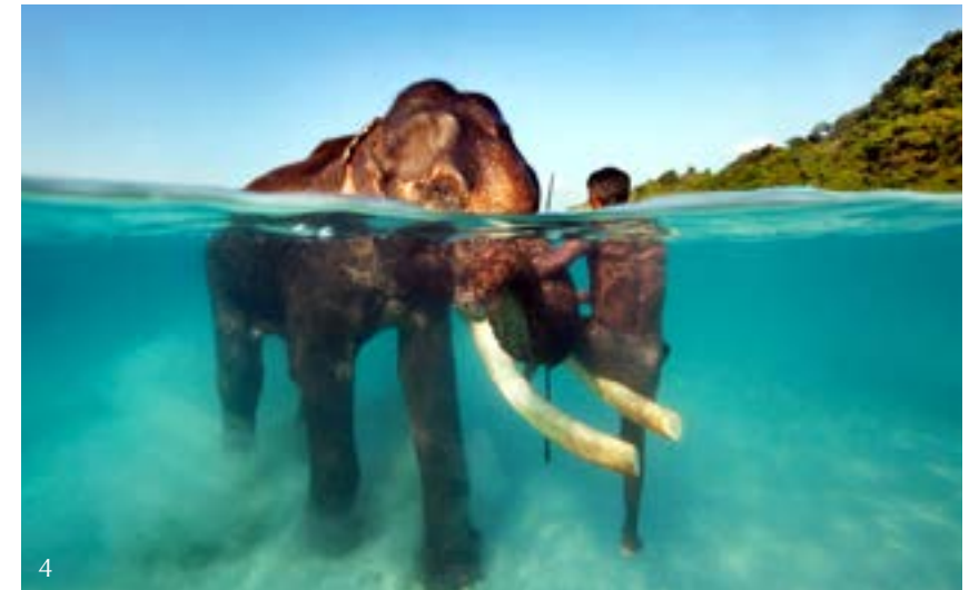
ABOVE: MALDIVES – RIGHT: 1.RAJA AMPAT 2.SEYCHELLES 3.MYANMAR 4.ANDAMAN ISLANDS