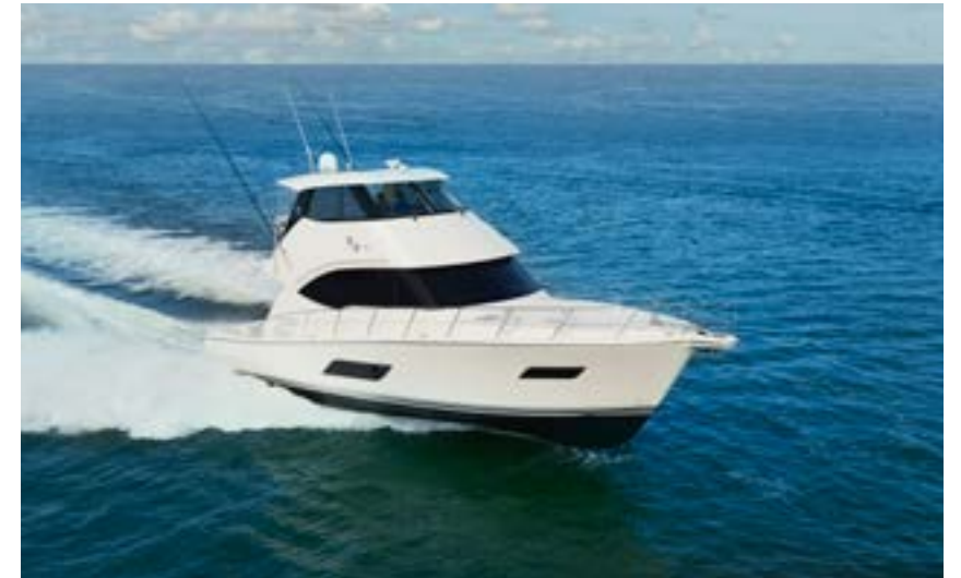
RIVIERA 52 Enclosed Flybridge