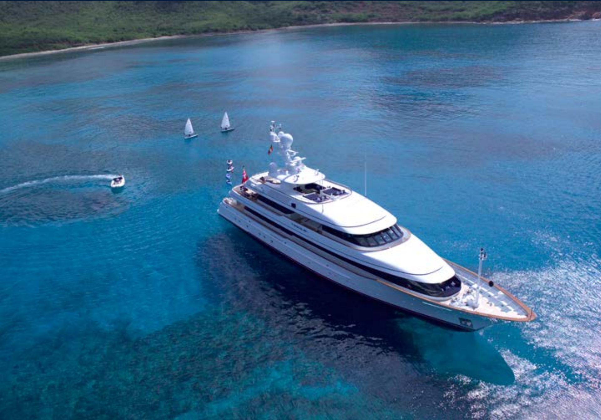
ABOVE: FEADSHIP 63M – M/Y TWIZZLE