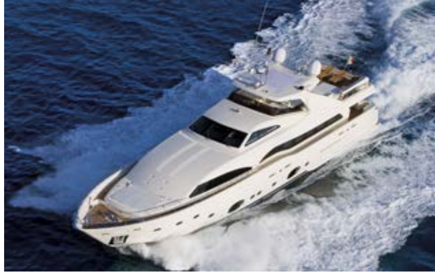
CUSTOM LINE 112