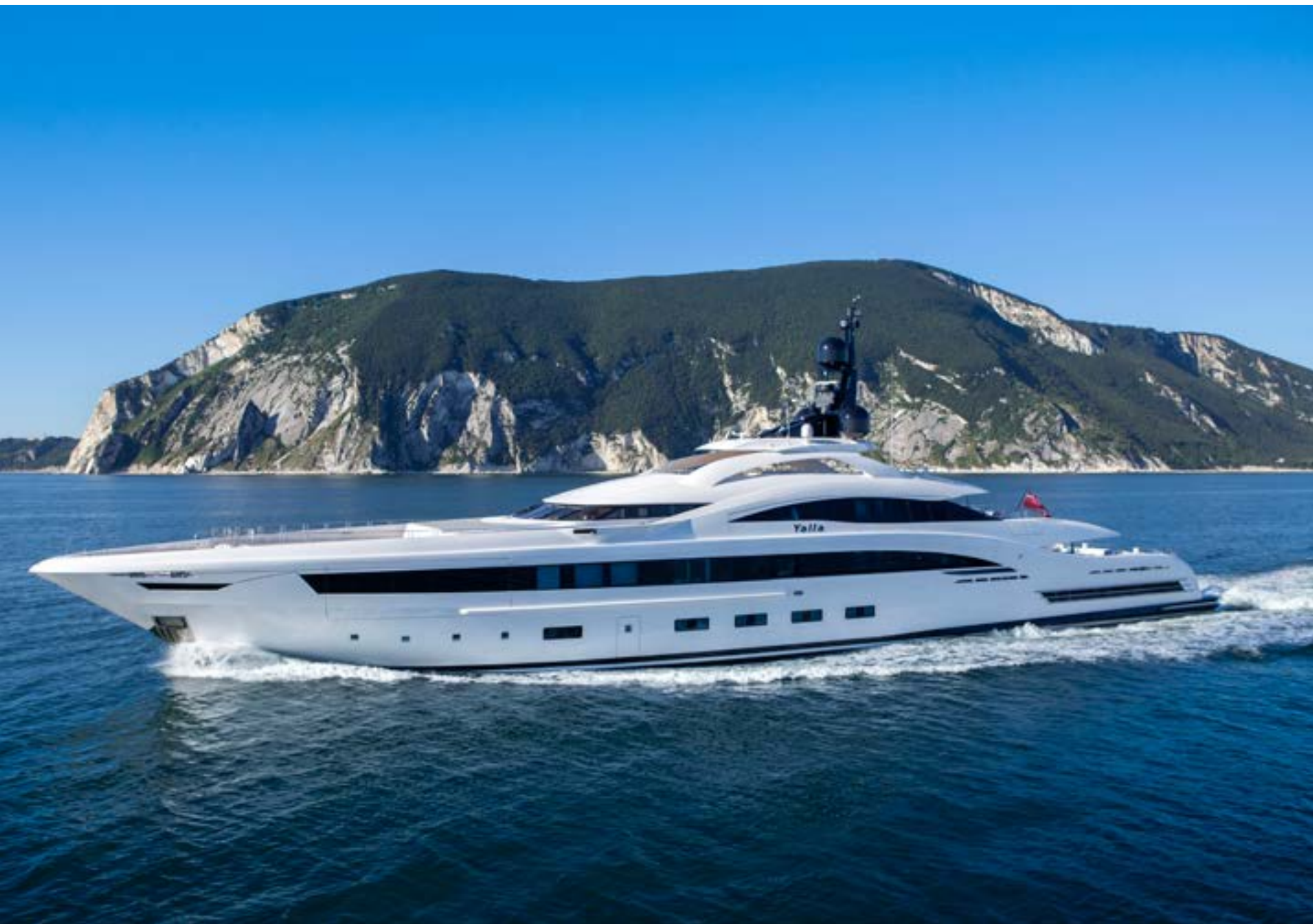
ABOVE: CRN 73M – M/Y YALLA