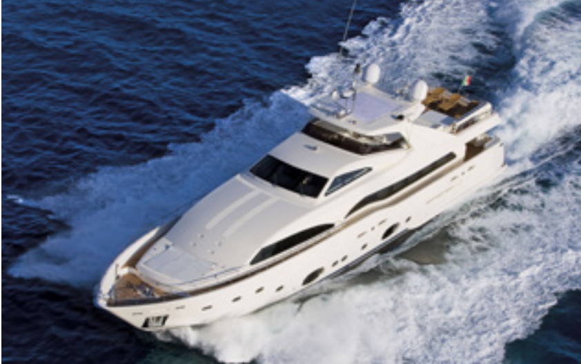
CUSTOM LINE 112