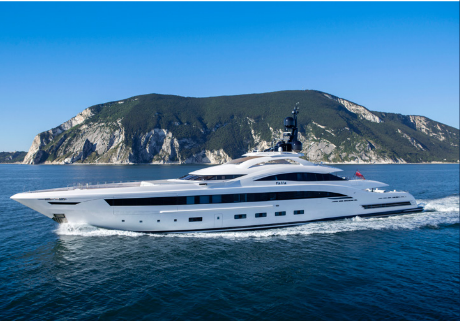
CRN 73M – M/Y YALLA