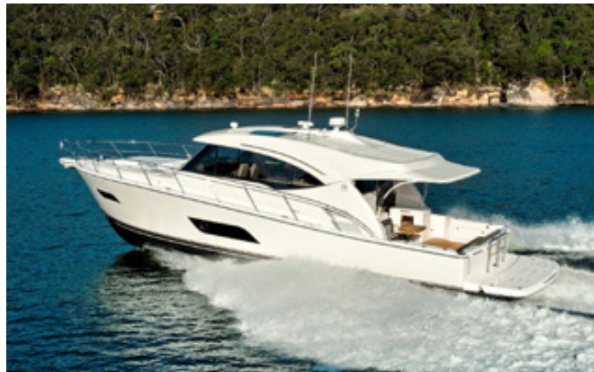
RIVIERA 525 SUV