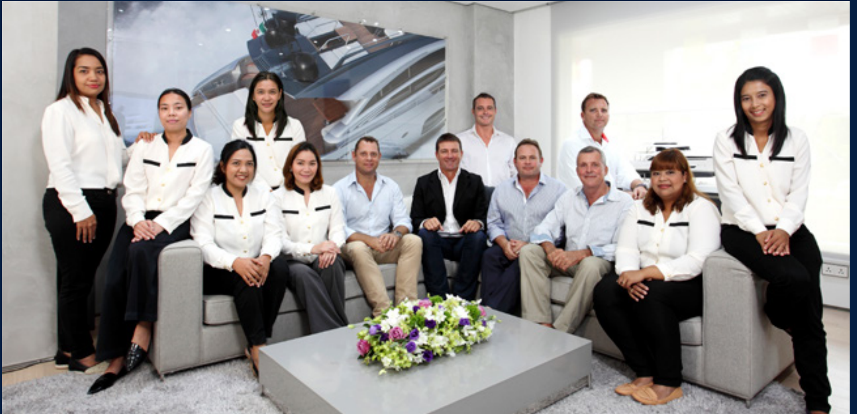
LEE MARINE TEAM