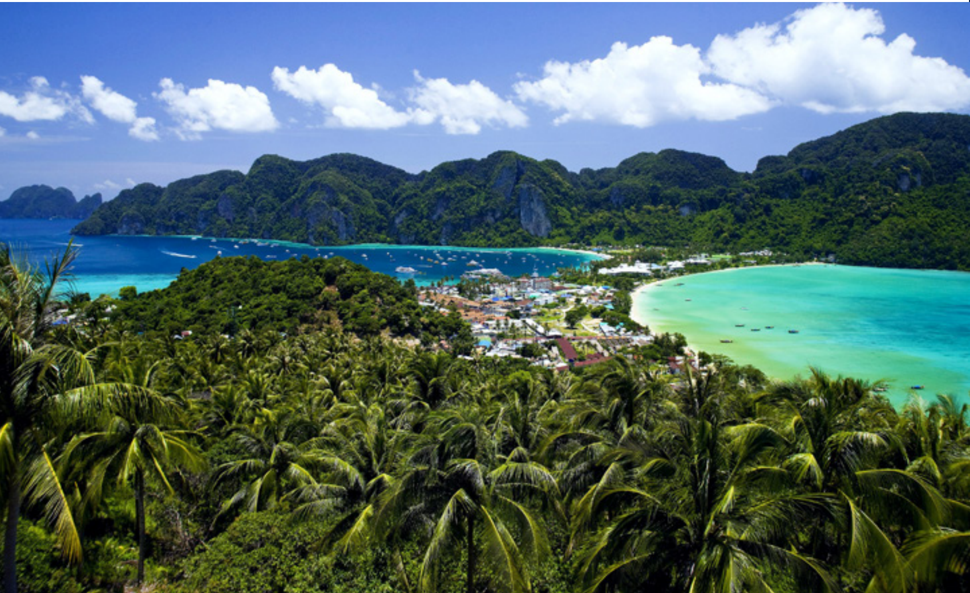
PHI PHI ISLAND