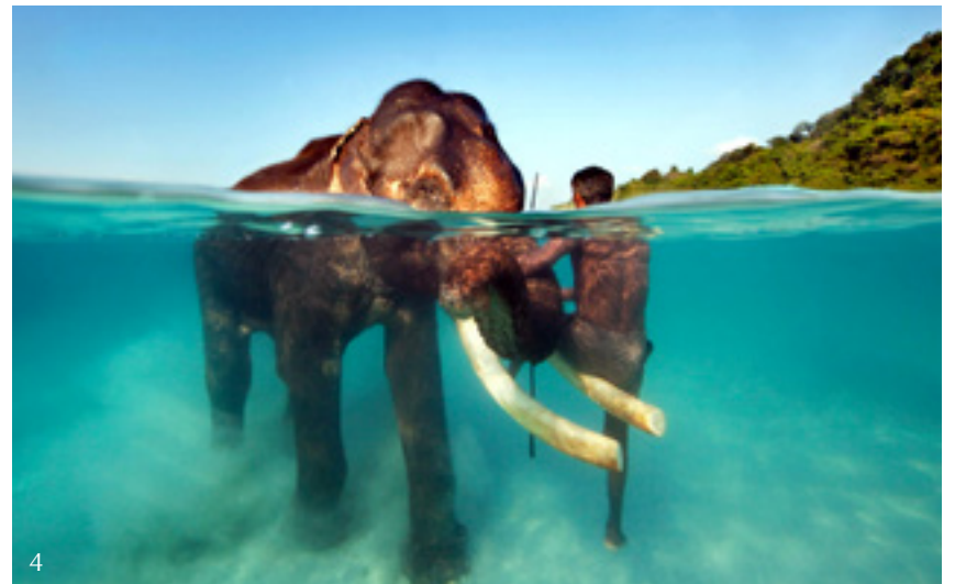
1.RAJA AMPAT 2.SEYCHELLES 3.MYANMAR 4.ANDAMAN ISLANDS