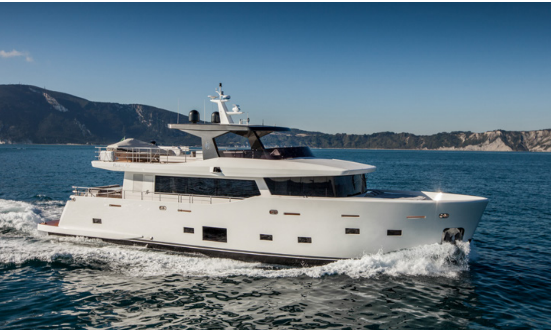
NAUTA AIR 90

Creating a niche, these builders produce long range, metal superyachts that are fully customised for those who love the sea and establish a distinct relationship with it. CdM vessels ply the waves with high quality and production excellence that include two distinct ranges: the Nauta Air, semi-displacement series and Darwin Class, full-displacement yachts.