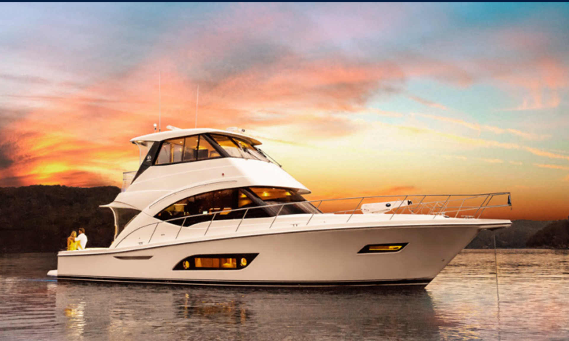
57 ENCLOSED FLYBRIDGE

From a dream that began over three decades ago has emerged Australia's most respected manufacturer of luxury on-water, pleasure craft. With a full range of Sport Yachts and Offshore Flybridge models, the name Riviera is synonymous with quality and practicality. Within Riviera, passion and craftsmanship mesh skilfully with the newest technology producing boats that withstand the test of time, while offering superb sea thoughtfulness and reliability.