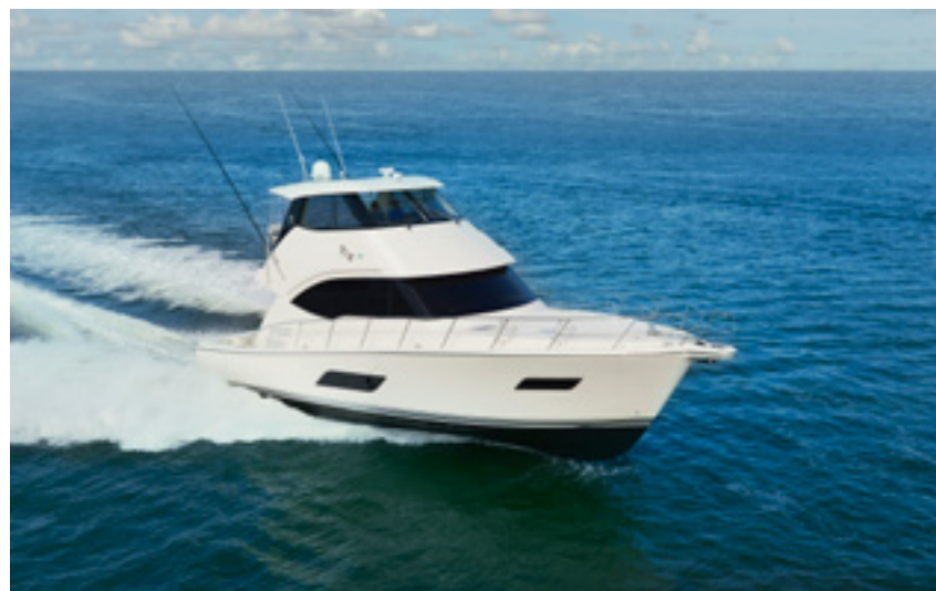
RIVIERA 52 Enclosed Flybridge