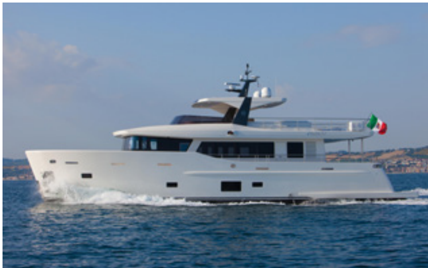
CdM NAUTA AIR 86