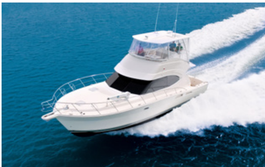
RIVIERA 45 Open Flybridge