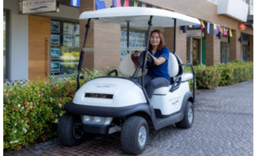
ATARI, LEE MARINE BUGGY

Catch a ride in Lee Marine's golf buggy – whiz off to the Marina docks and step aboard the many yachts listed with Lee Marine International Marine Brokerage.