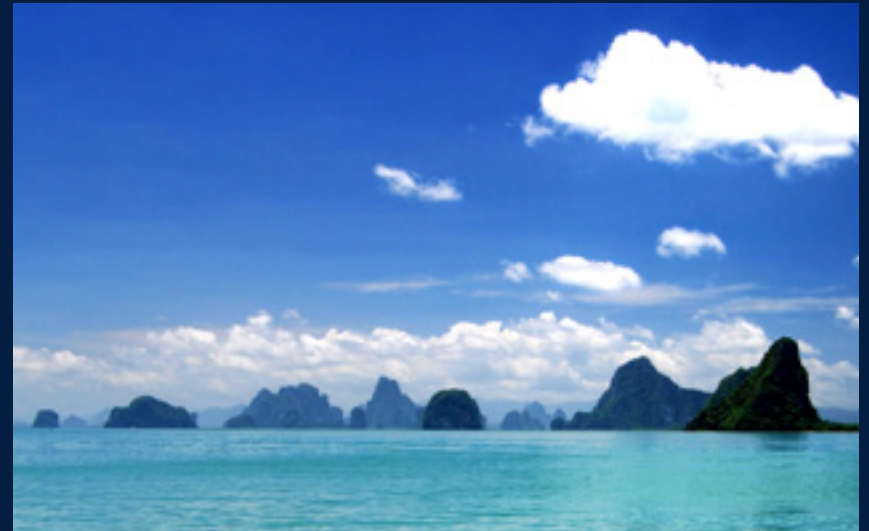
HONG ISLAND KRABI AND PHANG NGA BAY

Thailand is a boating paradise with the Andaman Sea to the west and the Gulf of Thailand to the east. Sublime weather, countless islands, marine national parks and access to the whole of South East Asia makes Thailand a perfect choice. Whether cruising, sailing or diving, with some of the world's best cruising grounds and easy access to world-class marinas, there truly is no better place to buy and own a boat.