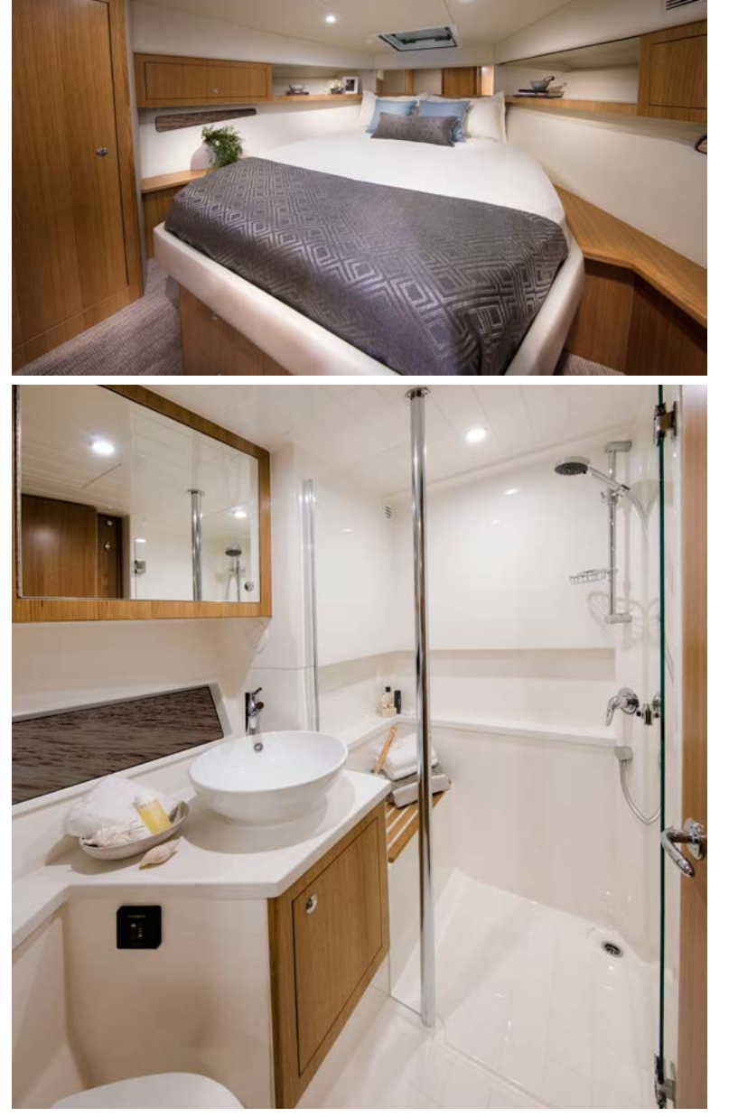
Satin Oak timber finish

Immediately adjacent you will discover your en-suite bathroom (with two-way access). Beautifully appointed and generously proportioned, it features a walk-in shower, full vanity and basin, superbly detailed timber drawers and large, well lit mirrors.