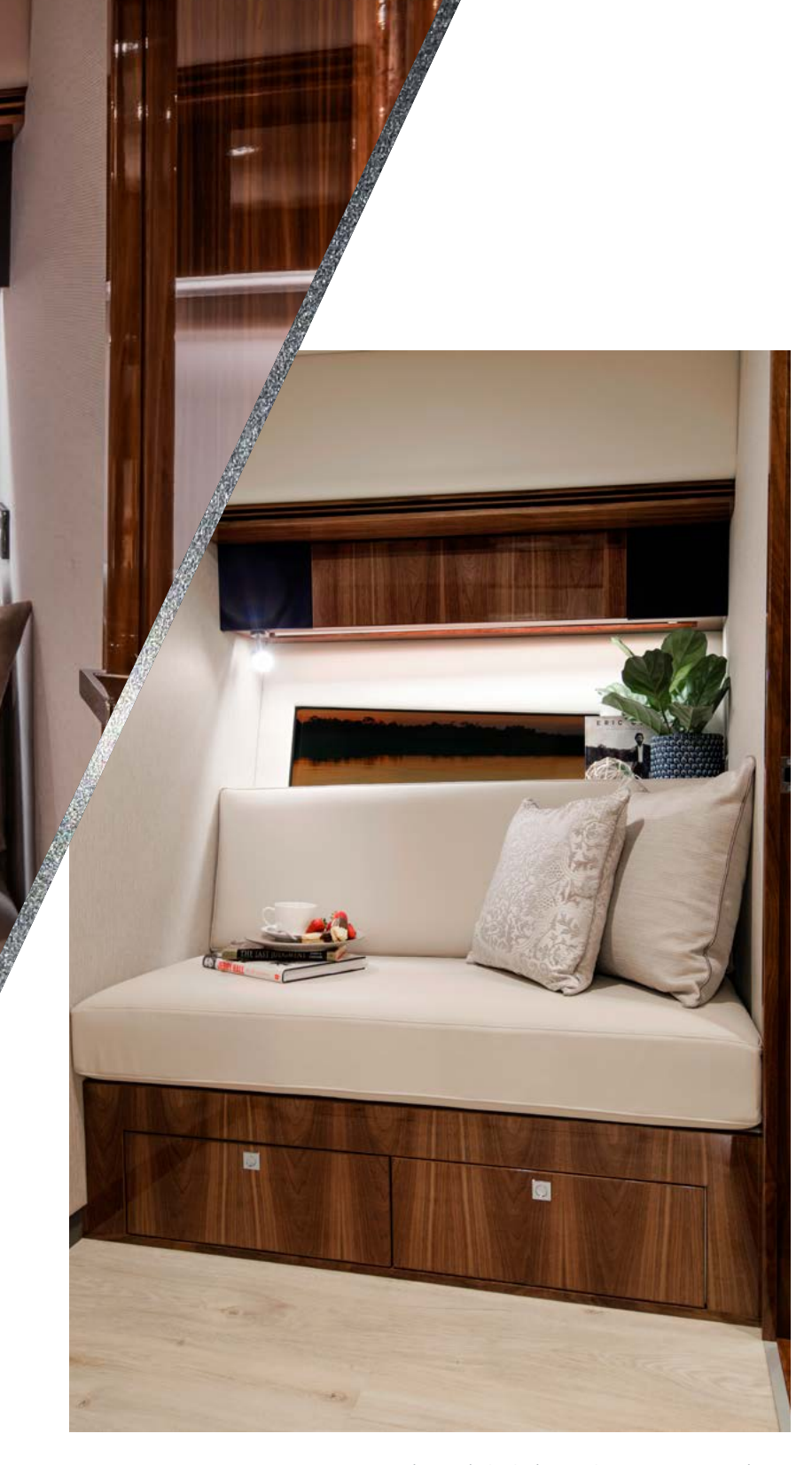
Lower lounge design in the Premier master stateroom layout