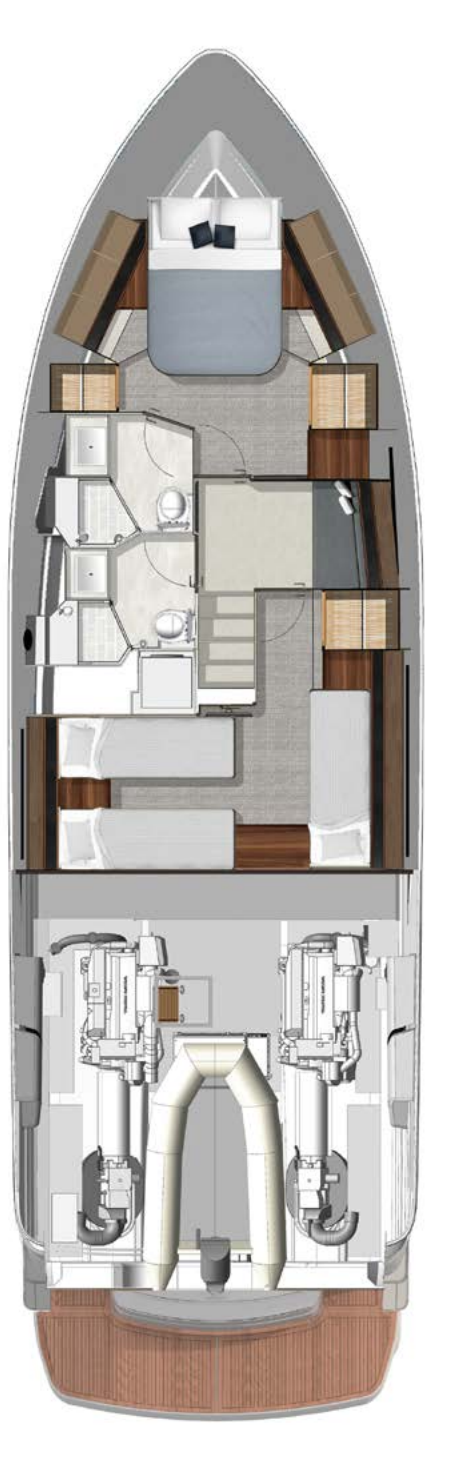
Optional Premier design