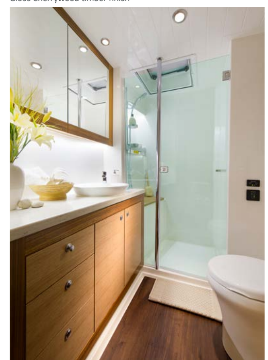
Satin Oak timber finish