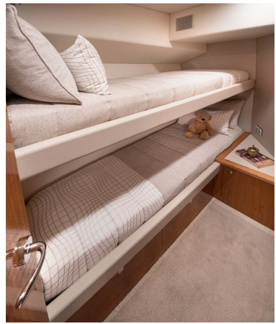
Gloss Cherrywood timber finish